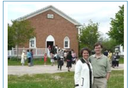
In front of the Markham church where we were married in 1989. A Chinese wedding was just letting out.

"Come ye apart and rest awhile." Mark 6:31 Those are the words painted on the wall at the front of the church where we were married, and May 20 marked our 20th wedding anniversary! We enjoyed looking through old photos, trying on the wedding dress, and re-visiting the museum church (a good choice, it turns out, since the place where we had our reception AND the hotel where we stayed to begin our honeymoon no longer exist!)